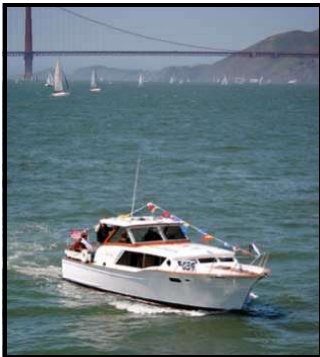
Fleetwood on San Francisco Bay

Another technological milestone for the CYA, we now have a facebook page. I think you have to create a facebook account ( www.facebook.com ) to access it but there is no charge and it seems to be a good way to communicate. You can post photos or comments as well as link youtube videos or other links to the page. When you are in facebook, type in Classic Yacht Association and the page will pop up. Many of my friends have business pages on Facebook and there are a few Delta related pages that might be of interest.