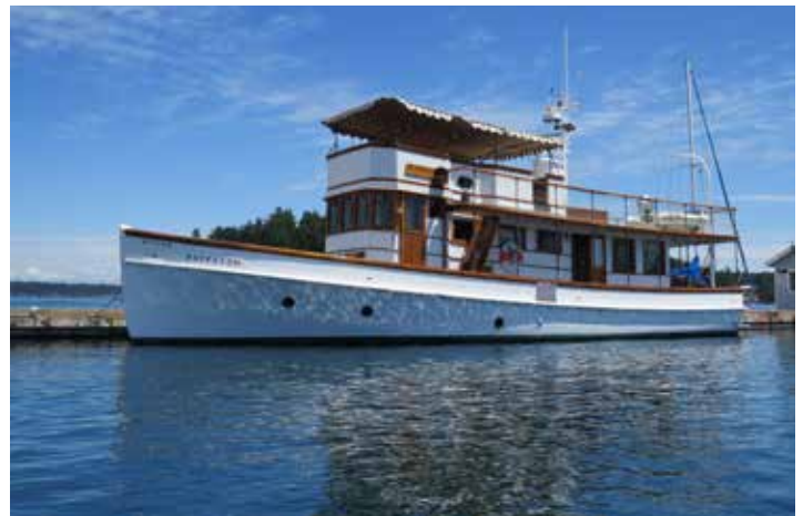
Phil Lacerte PASPATOO 66' 9" 1942 Blanchard Boat Co. PNW Fleet Kit Pingree, sponsor