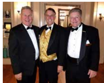
Gentlemen gather for the Fleet's traditional Scotch Salon following Change of Watch.