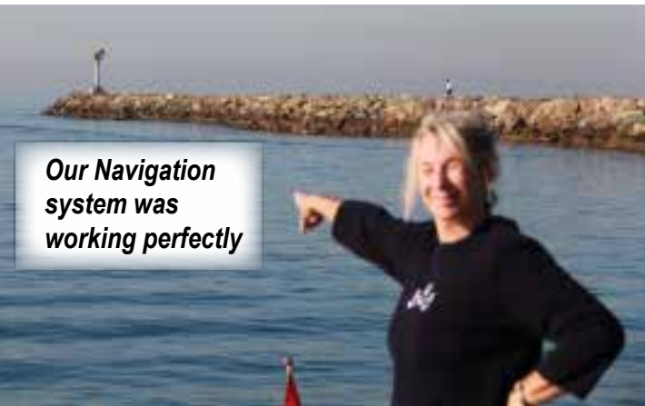
Our Navigation system was working perfectly