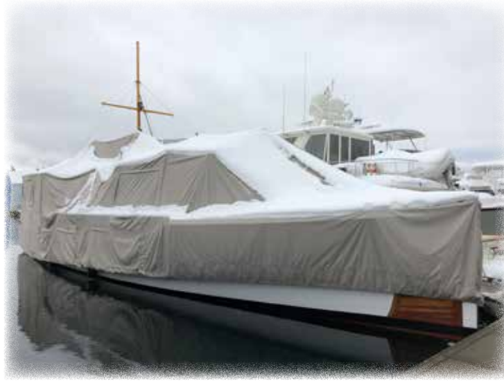
OLMAHA covered & hibernating for the winter

For fleets in the more northern regions, it is approaching time to put their crafts to bed for the winter. Our CYA fleets have enjoyed a very active 2019, evidenced by participation in local fleet events and the cruising experiences documented by newsletter reports and fleet Facebook postings. In keeping with our important heritage mission, well-attended show gatherings have provided great chances to share our floating antiques with the general public. Some of the shows have been creatively supplemented by including gatherings of vintage autos and (heaven forbid) even wooden sail craft. I congratulate all fleets with their success in recruiting new members. At present we have 27 new CYA members for 2019.