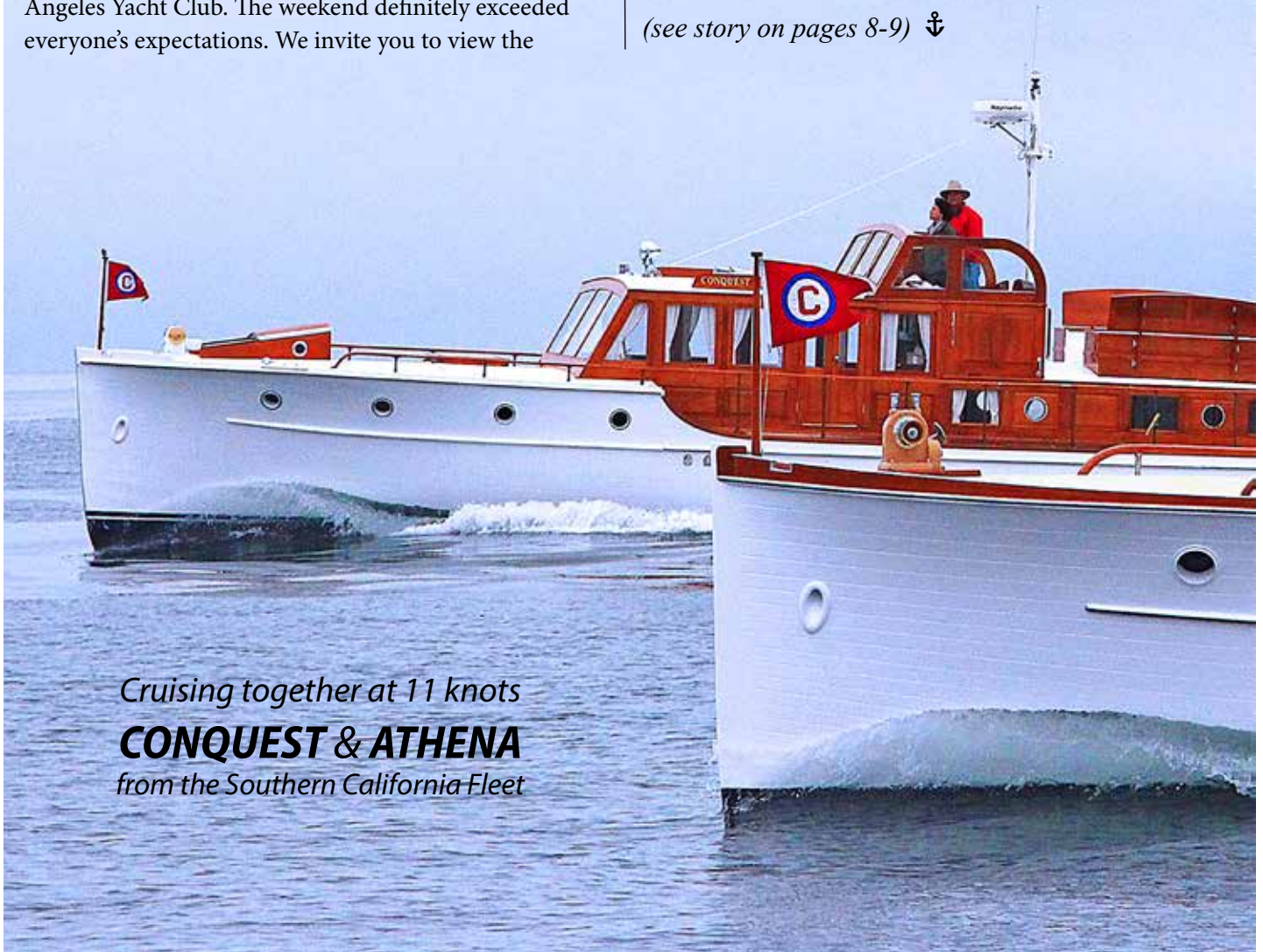
Cruising together at 11 knots CONQUEST & ATHENA from the Southern California Fleet