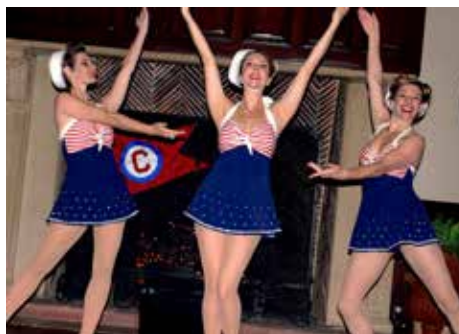
Vintage entertainment, The Sugar Sisters, brought the audience to its feet in a standing ovation.