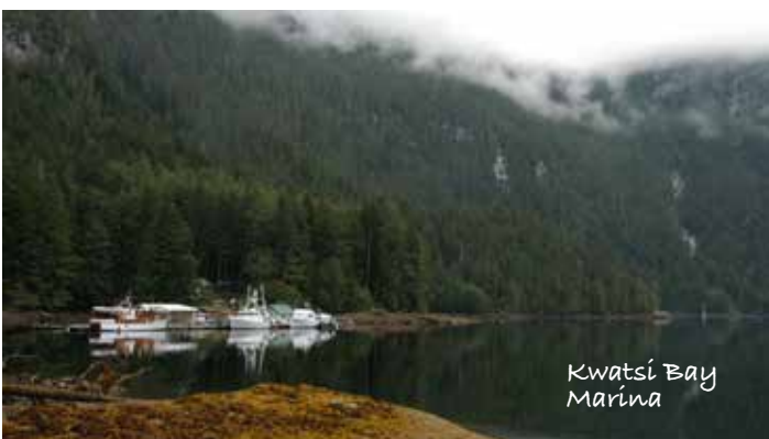
Kwatsi Bay Marina

The next morning, running down Sunderland Channel, we entered the section of Johnstone Strait that is unavoidable if you want to get further north. Despite the