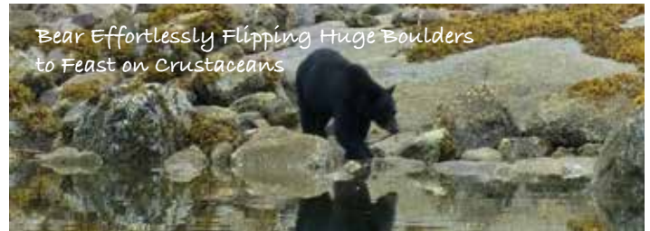
Bear Effortlessly Flipping Huge Boulders to Feast on Crustaceans