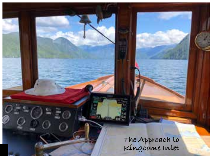
The Approach to Kingcome Inlet

Previously thinking Kingcome Inlet a hostile place with no good anchorages, we had never ventured in. Now