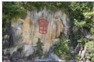
Giant Modern Pictograph at Petley Point