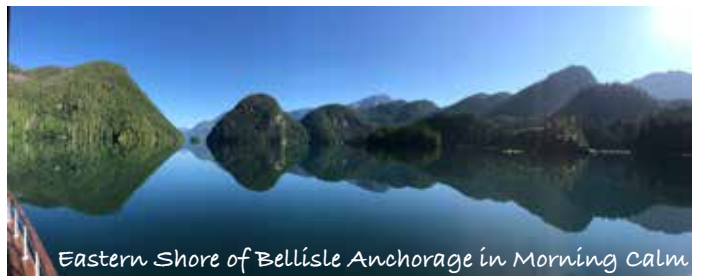
Eastern Shore of Bellisle Anchorage in Morning Calm

mile leg docking in Kwatsi Bay. The engaging owners, Max and Anka, the spectacular scenery, the potable UV treated water and the “happy hour” always populated by interesting fellow boaters make this a must-visit marina.