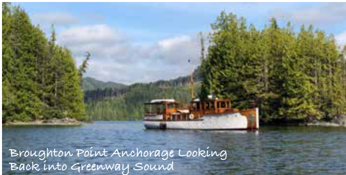
Broughton Point Anchorage Looking Back into Greenway Sound

intrigued by the reported pictographs at the head of the inlet and realizing Bellisle Sound, a small fiord about 10 nautical miles from the head, could be a nice anchorage,