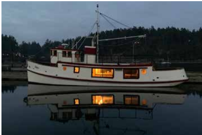
Crystal Toupin and James Brickenden ATLAS 50' 1909 W M Grant Classic Tug CAN Fleet Cecilia Rosell, sponsor