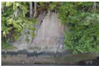
Old Pictographs of Coppers and Deer At Petley Point

we decided to go for a visit. It was a perfect day for the trip with sun and high clouds as we transitioned from sloping hillsides to towering cliffs. As we progressed up the inlet the water took on a lovely glacial blue becoming blue-green milk at the head. Our depth sounder alarm insisted on sounding a shallow water alarm when it decided the interface between the glacial water and salt water was the bottom. Around Petley Point near the inlet head we were rewarded with a number of First Nation pictographs, including a 90-year-old one by artist Mollie Wilson and high up the vertical cliff side the huge modern pictograph