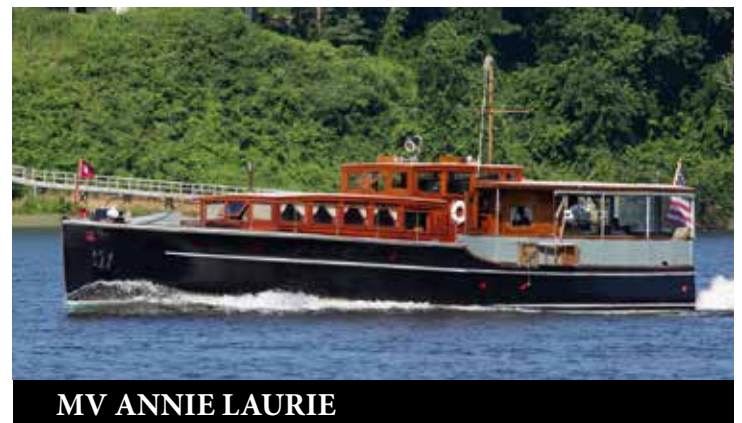
MV ANNIE LAURIE

One element that has not changed is the parade. Formerly it had been scheduled on Saturday, but now takes place around noon on Sunday. Usually, the whistle from S.S. SABINO blows as a signal to cast off. Inevitably, the bridges do not cooperate, and this year did not fail to meet our expectations! There are two bridges on the navigable portions of the Mystic River. The first bridge one encounters heading south is the ancient "Mystic Highway Bridge." It is a magnificent, open grate, "singing" bascule bridge, that used to have an alternate mechanism to raise the thing by hand, should a power-out emergency arise! The second bridge, The Mystic Rail, lies just 2500' south of this position. Our ever-present hope is that the two bridges will