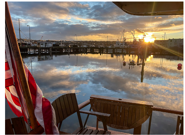
Sunrise on the stern deck.

What is most satisfying? Feeling the history of the boat when I get up in the morning. Watching the