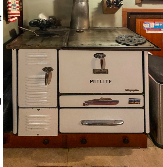
a big hit at My wonderful Olympic Y18 stove/heater.

post-Thanksgiving potluck this year. The diesel heat also dehumidifies, while it heats about 75% of the boat - all but the forward cabin.