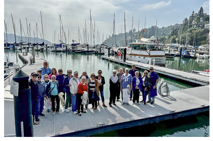
All ready to board \it Aurora\ V along side the finger dock.

The cruise day arrived, Aurora V left her homeport of Emeryville at 0930, headed towards Treasure Island. They then cruised along the east side of Angel Island and west into Raccoon Straits. After passing Ayala Cove and the Corinthian Yacht Club, Aurora V made the final northerly approach into the San Francisco Yacht Club harbor. Aurora V 's 61' LOA makes docking at the San Francisco Yacht Club a bit tricky. Coming down the narrow fairway, I poked Aurora V 's bow into a slip to pivot her, so that I would be going stern first through the remainder of the narrow fairway into a small turning basin, no more than 100' long. As Aurora V neared the end of the basin, I proceeded to