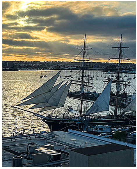
Sunset over San Diego Harbor.

I feel a bit like the Kevin Costner character in the movie. Putting something together on the blind faith that people will come. Several years ago. Southern California Fleet members realized that it would be our turn to host the Association Change of Watch soon. This was during mid-Covid shutdowns and no one could predict where we