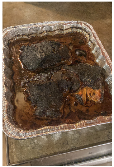
Slow-cooked pork

post-Thanksgiving potluck this year. The diesel heat also dehumidifies, while it heats about 75% of the boat - all but the forward cabin.