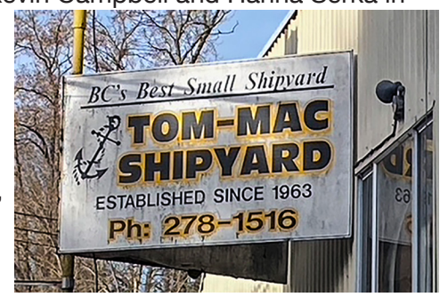
Tom-Mac's home in Richmong BC

the front office co-ordinate all the projects as well as sourcing an enormous amount of product, lumber, fittings, metal, plumbing, etc. Although the vard does a large amount of tugs and other