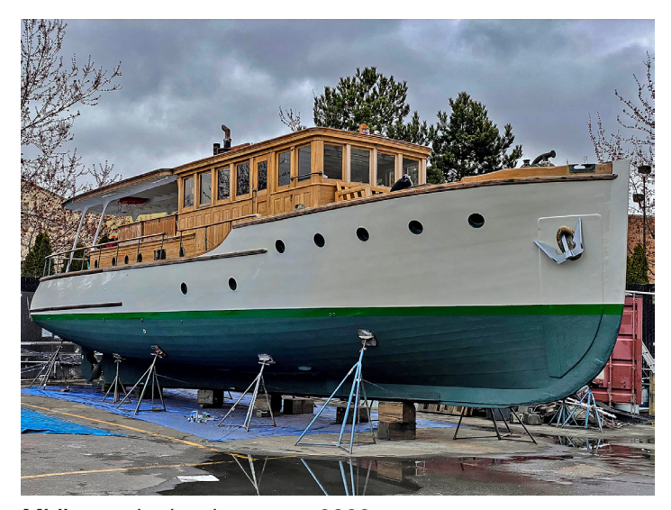
Mitlite on the hard summer 2023. length - 58 ft, Builder: Foss Maritime, 1933.