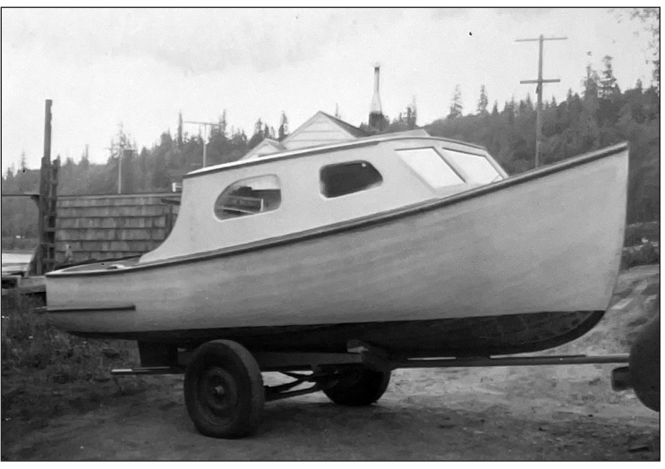
Byron Suldan's fishing boat he built in the early days of Suldan's Boat Works