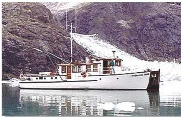
Princeton Hall , a CYA vessel built in Alaska in 1941 and still cruising Alaska waters.

With the matter of membership resolved, the International Board of Directors' next action will be a decision on suspension of the Alaska Fleet charter. In the meantime, I have gathered a few thoughts and anecdotes from various sources to commemorate the Alaska fleet that was.