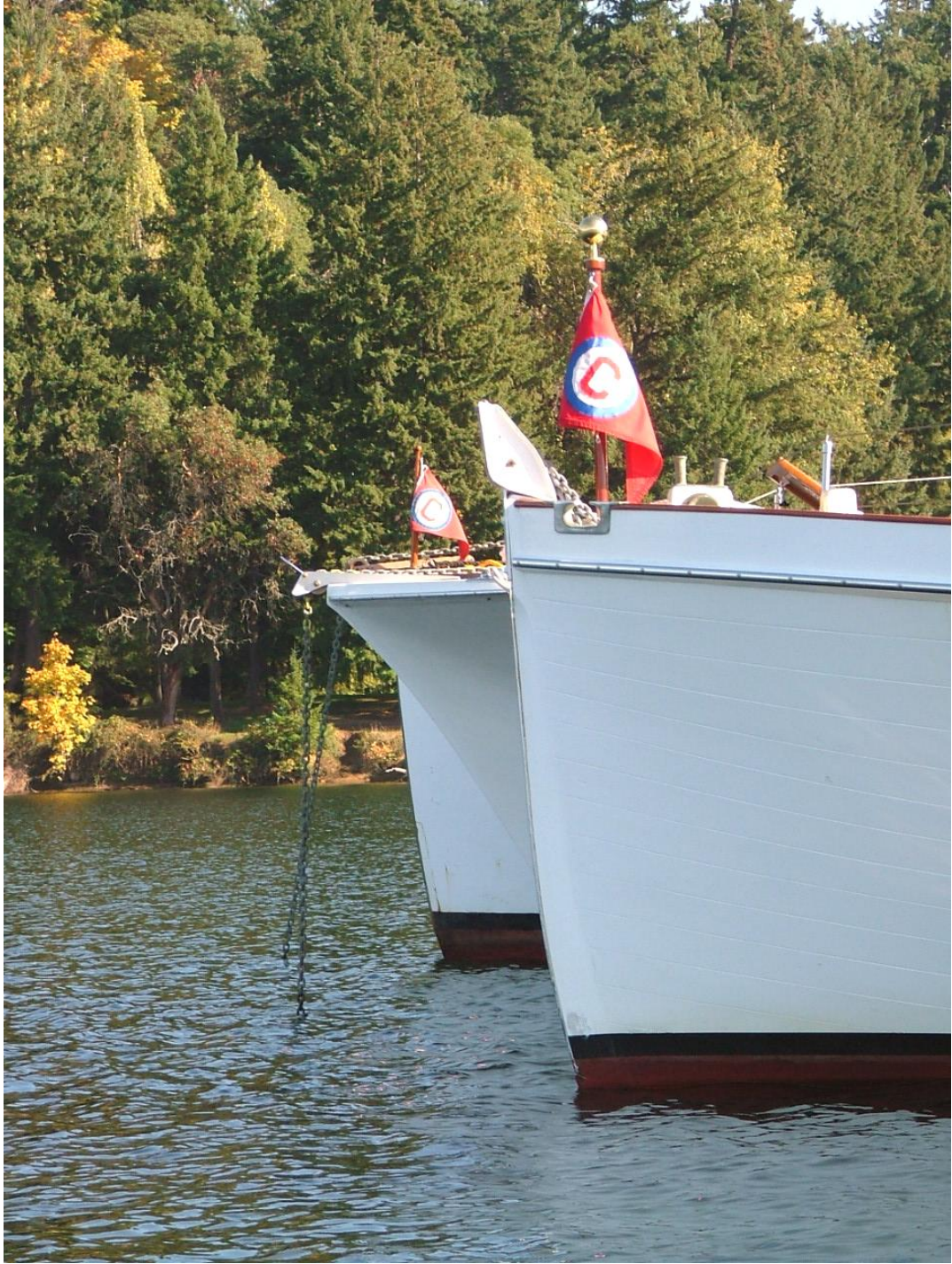
Classics, at ease.