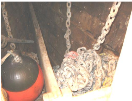
950 feet of chain!