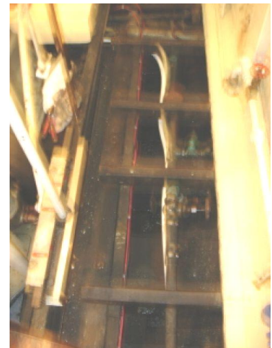
Be grateful this is out of focus – it's scary in there!