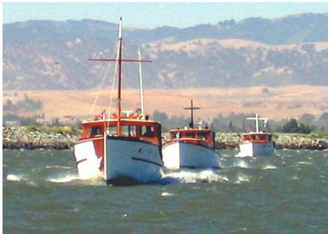
Colleen, Killara, Northstar II