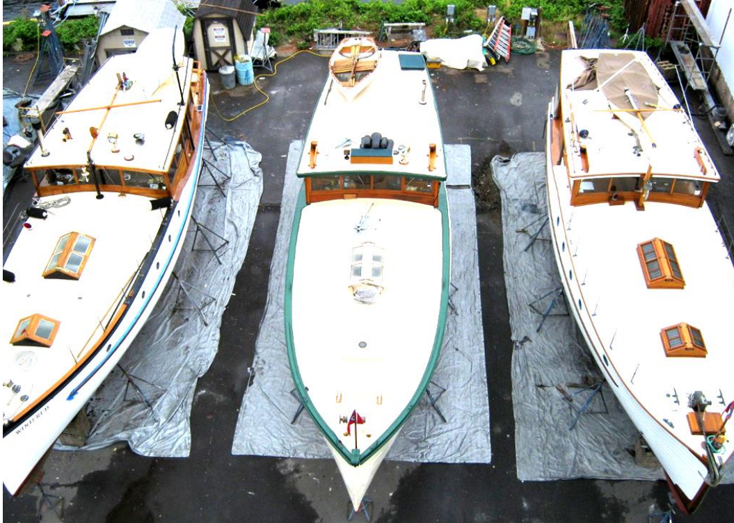
Winifred (1926)

An historic haulout occurred recently at CSR Marine in Seattle, WA, USA. Three CYA-member "Lake Union Dreamboats" were hauled and placed in the yard side by side. "Lake Union Dreamboats" were built by Lake Union Drydock in Seattle. The smallest "Dreamboat" built was 42 feet long; some were built originally 45 feet long. All three boats pictured here were built as 42-footers. One of the earlier owners of Winifred had the boat extended at the stern so the cockpit would be larger, hence this boat's length today of 46 feet. More information about Lake Union Drydock "Dreamboats", their smaller, older predecessors (Blanchards and Grandy/Taylors and such), and other boats similar in style can be found at http://classicyacht.org/ludreamboat . There are a good number of these great boats still plying the waters of the USA and Canada, most of them proud members of CYA.