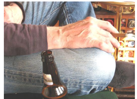
Smoking; cooking with garlic