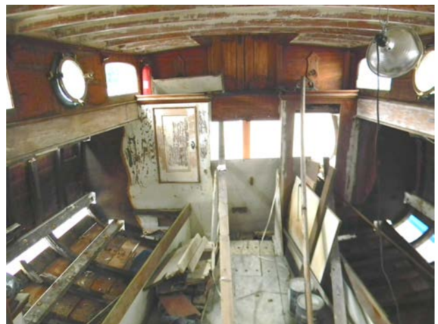
Main cabin in 2012