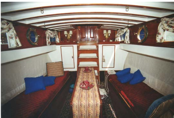
Main cabin in 2001

As Norm Blanchard said to me a decade or more ago, in reference to a particular motor yacht that his father had built, "When a boat sinks into such a deplorable condition, sometimes it's just best to let it go." True, perhaps, but nonetheless sad.