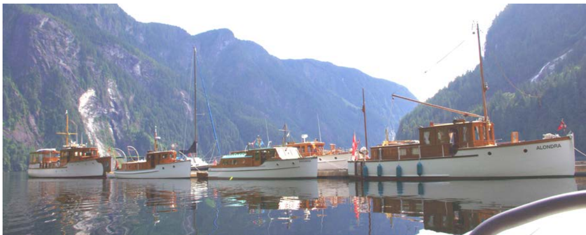
Olmaha, Merva, Patamar, Euphemia II, Alondra

For more information on the run up to Louisa, see my article in the 2009 CYA September newsletter.