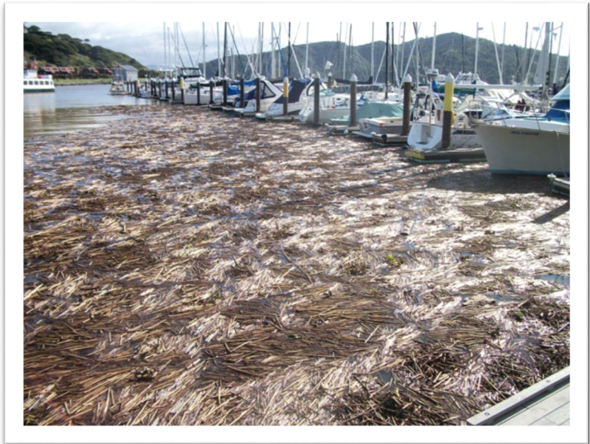
Massive clean-up needed at the Corinthian Yacht Club