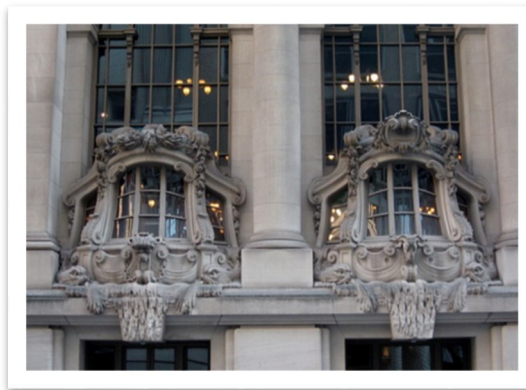
The New York Yacht Club