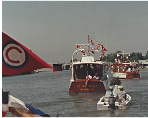
Bethel Island Parade, early 1990's

when you pass, the judges are on the boat too and it never hurts to look sharp for them.