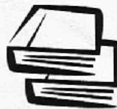
Photo Albums - Great Gifts for the Holiday!

The Holiday Parade of Lights will take place on December 18th . Our host will be the Loch Lomond Yacht Club in San Rafael. Decorated yachts from the Marin Yacht Club and San Rafael Yacht Club will join the Loch Lomond Yacht Club and C.Y.A. Northern California fleets in the parade. C.Y.A. vessel owners should plan to reserve slips at the Loch Lomond Marina or clubhouse guest dock on December 18th in order to secure places in the parade. Members arriving by "land yacht" will be welcomed aboard participating vessels. More information included with the newsletter.