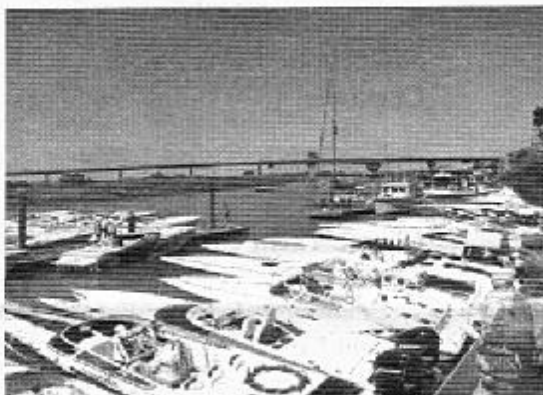
Can you find the Eslo among the Offshore Racers