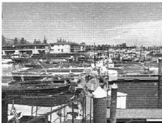
ACBS Boat Show in Tahoe