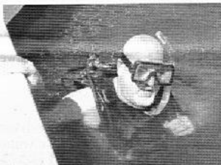
George to the rescue

Yachting Yearbook for 2005 will include many suggestions requested of the 100 clubs making up PICYA. This Yearbook is recognized as probably the best such publication in the whole of the US! Please place your order for a 2005 copy now (lower price for early orders). If you are not familiar with the content, please do yourself a favor and beg, borrow or steal a peek at one to see what you are missing.