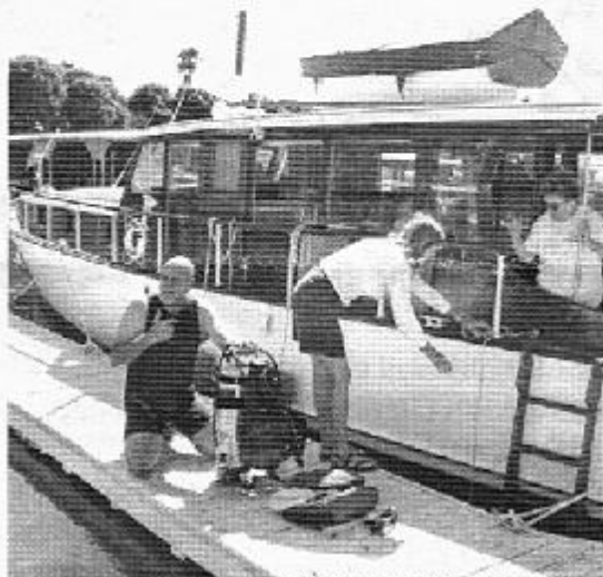
The great recovery - ask Dick Engfer about it!

On a lighter note: Theme for Opening Day on SF Bay 2005 is "Movies by the Bay".