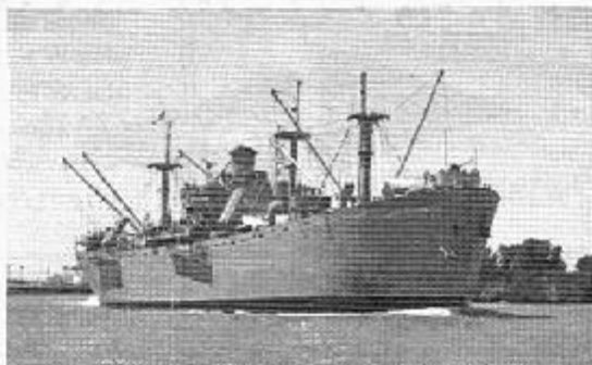
Eslo was able to share the San Joaquin River with the Jeremiah O'Brien