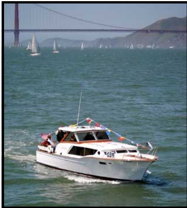
Fleetwood on San Francisco Bay

Another technological milestone for the CYA, we now have a facebook page. I think you have to create a facebook account ( www.facebook.com ) to access it but there is no charge and it seems to be a good way to communicate. You can post photos or comments as well as link youtube videos or other links to the page. When you are in facebook, type in Classic Yacht Association and the page will pop up. Many of my friends have business pages on Facebook and there are a few Delta related pages that might be of interest.