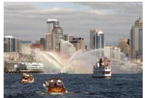
Photo of Parade

Congratulations go to ORBA, recipient of the "Best Classic Motor Preservation Award". We hope to see everyone at the 2011 Bell St. Rendezvous. We've put in an early request - - summer weather in June for Seattle next year!