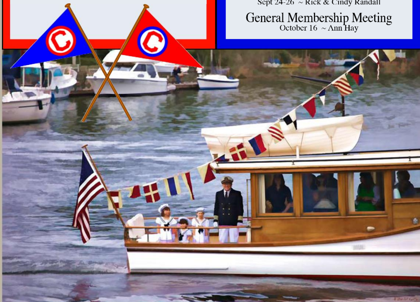
Opening Day