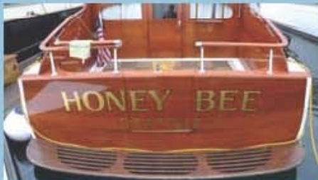
Above: HONEY BEE, Right: PATFOSS