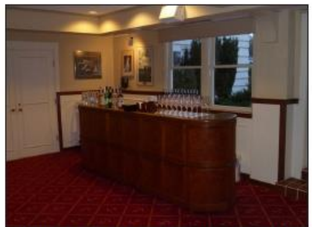
Raising the Bar: The lush appointments of the Seattle Yacht Club- the quintessential nautical setting for the Change of Watch Banquet.