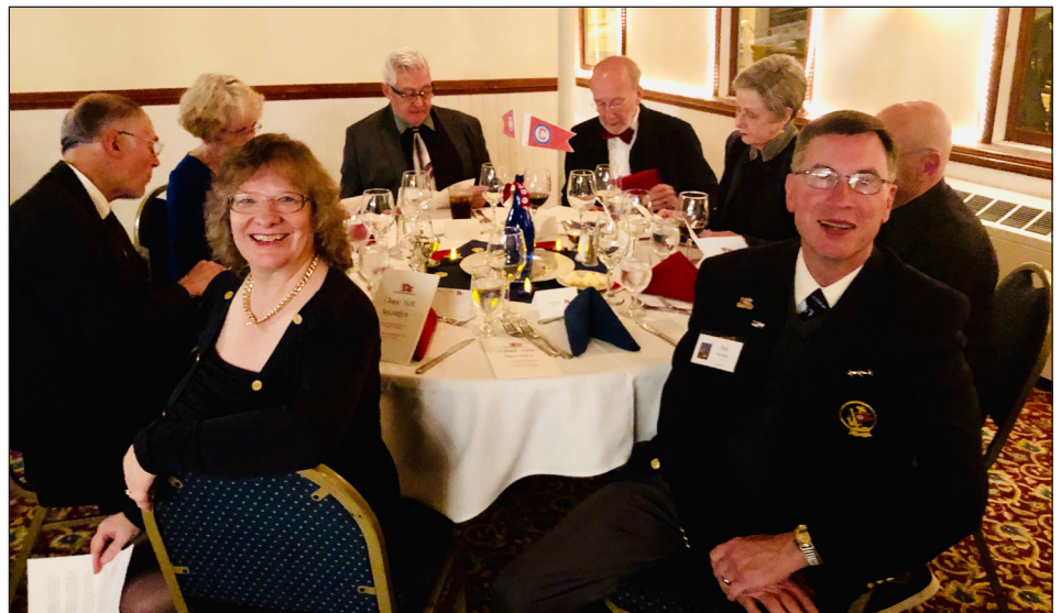
▲ CYA Members gather in the banquet room for an excellent Change of Watch Dinner.

while no formal activities were planned that evening, many of us managed to renew old friendships or meet other members for the first time in the cozy Delta King bar, surrounded by enough mahogany to warm the heart of any Chris-Craft owner. Those choosing to take the optional Friday excursion visited the Haggin Museum in Stockton, which houses an extensive collection of records gathered from the Stephens Brothers yard when it closed in the 1980s. This was followed