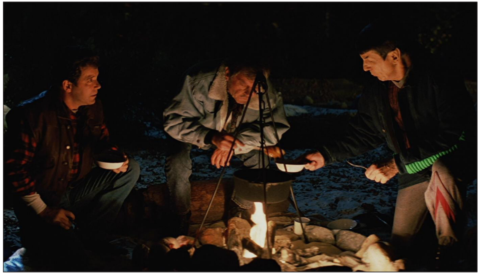
▲ Even the crew of the Starship Enterprise enjoys the pleasures of “camping out.”