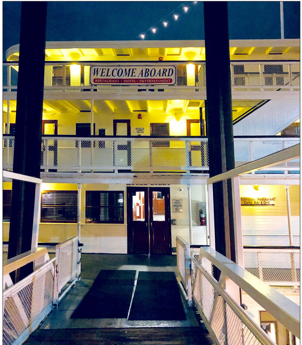
▲ Delta King beckons CYA members aboard for the Change of Watch Banquet.