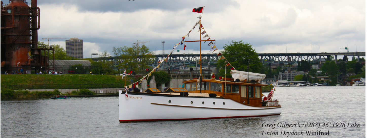
Greg Gilbert's (#288) 46' 1926 Lake Union Drydock Winifred.

Next year's Opening Day will occur on Saturday, May 7, 2022. Put it on your calendar now and plan to bring your boat out to the festivities.