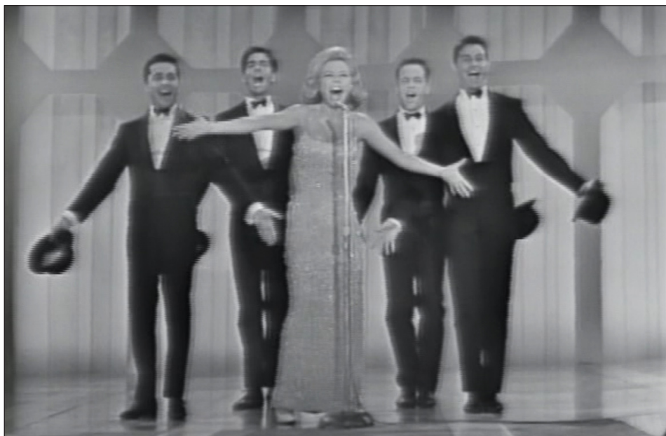
▲ Hollywood's Mitzi Gaynor performs "It's Too Darn Hot" on the Ed Sullivan Show on February 16, 1964.

As our summers continue to get hotter and hotter, we find ourselves in this situation more and more often: hot days roasting in the afternoon sun,