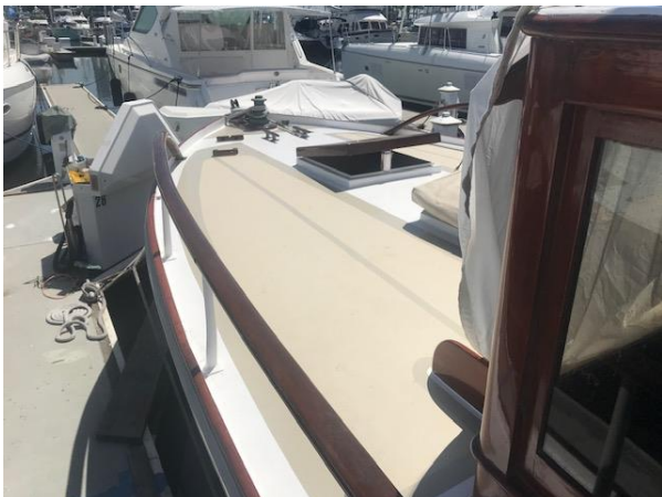
Front deck nonskid