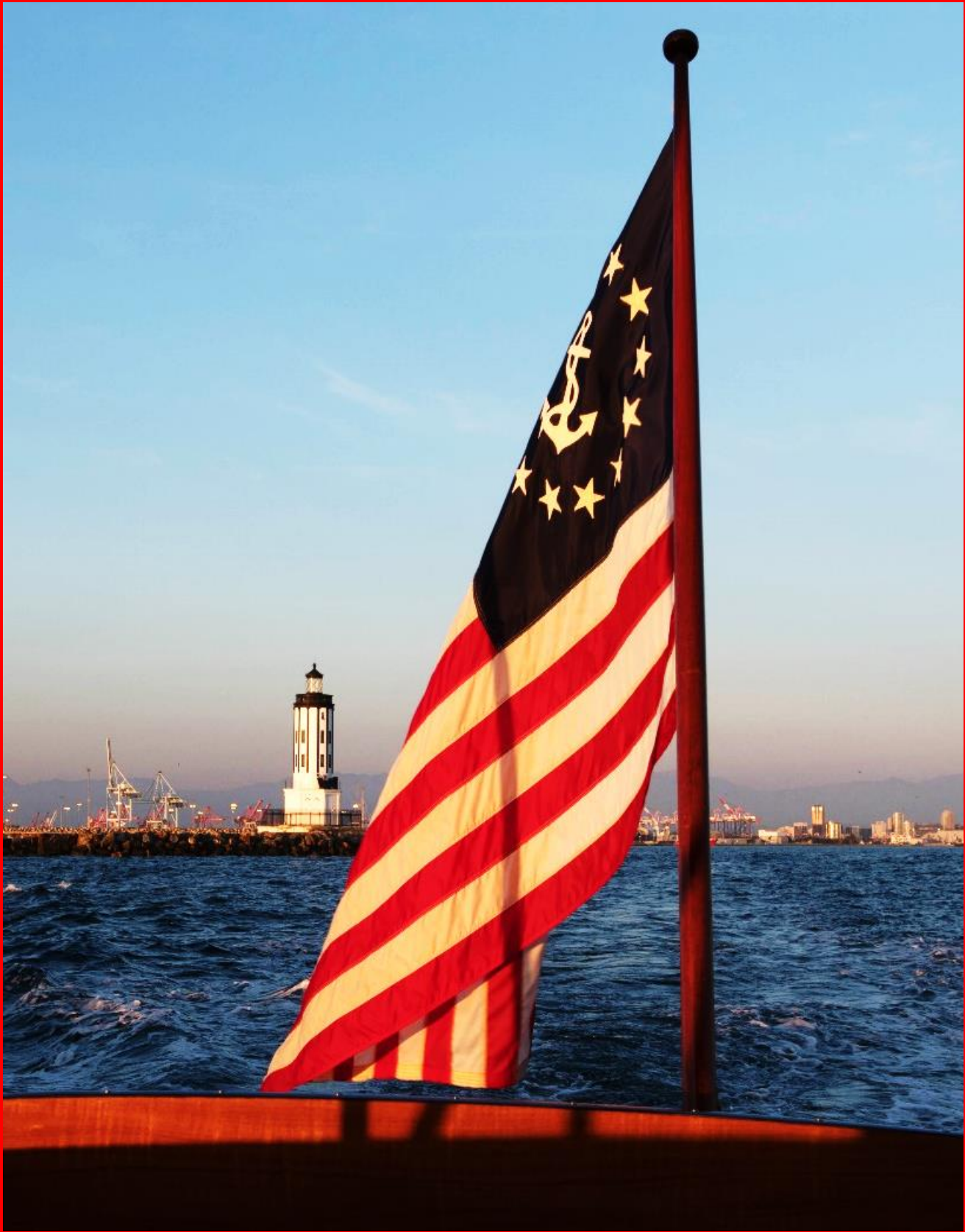
“Angel’s Gate ♦ Los Angeles Harbor “