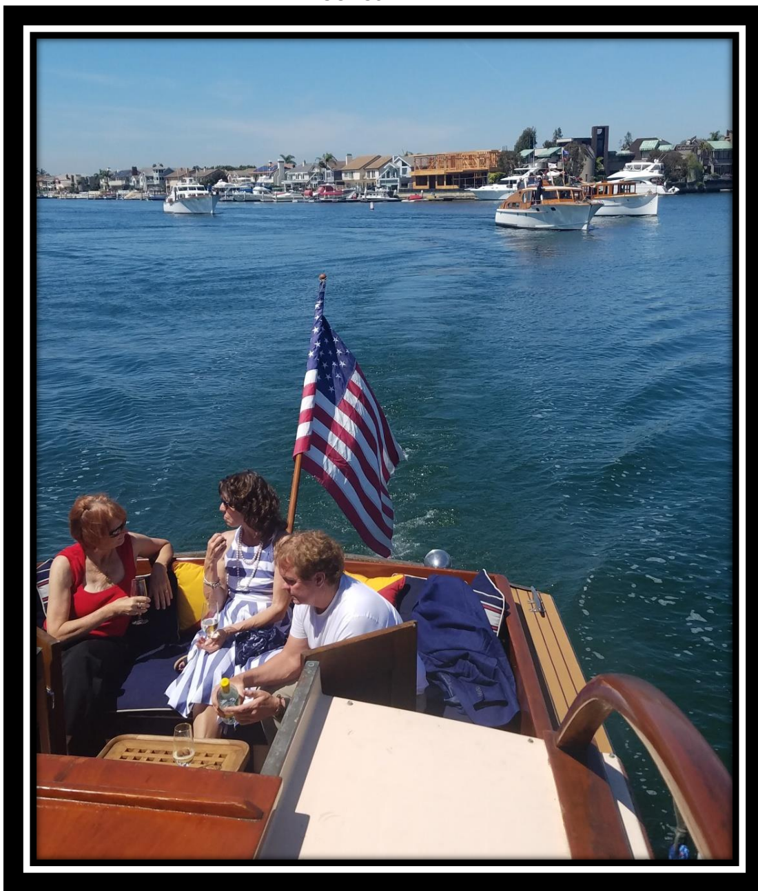
"Follow the Flag to Fun" ONO AFT DECK