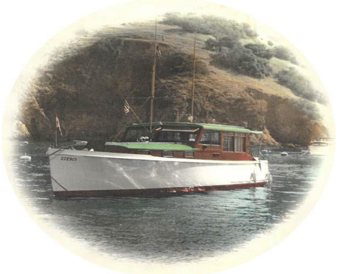
A 1940 photo at her favorite mooring at Cherry Cove