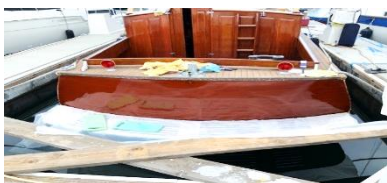
Her transom gleams and is ready for delivery of her gold lettering.