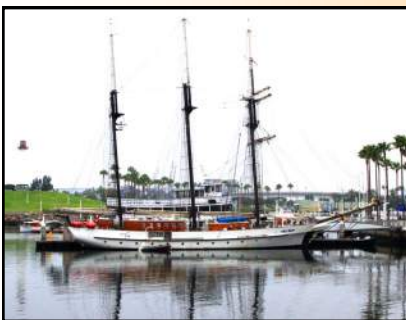
School Ship TOLE MOUR