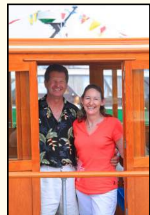
ATHENA - 1929 - 47 FOOT - STEPHENS BROTHERS