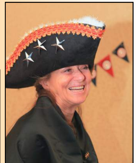
International Commodore Shawn Ball