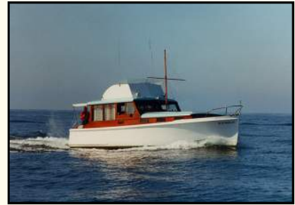
VERA LEE II - 1940 - 34 FOOT - ELCO