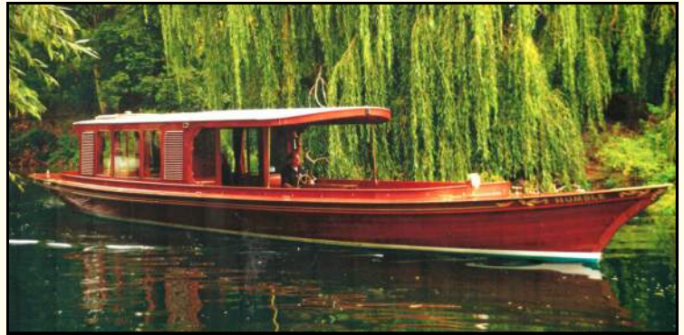
HUMBLE - 1902 - 52 FOOT - ENGLISH GENTLEMAN'S LAUNCH