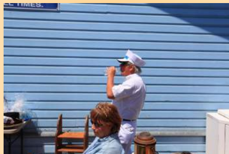
Scott the Good Humor Man brought ice cream for everybody