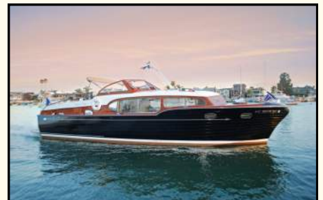
NO CORKAGE - 1954 - 36 FOOT - CHRIS-CRAFT COMMANDER

Thank you for joining the CYA. By definition we are dedicated to the promotion, preservation, restoration, and maintenance of fine old power driven pleasure craft.