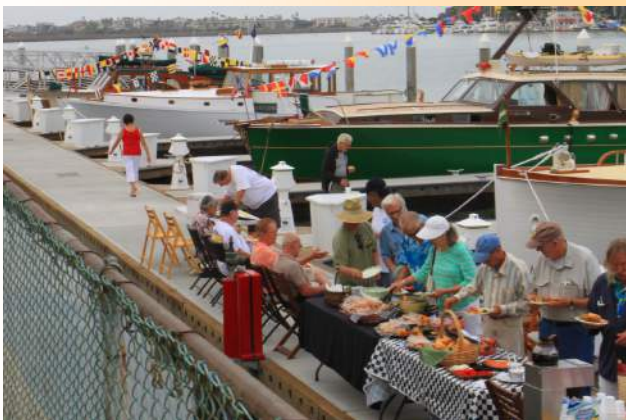
Car owners breakfast on the dock